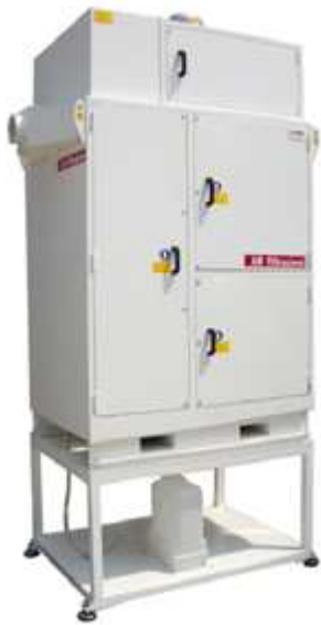
COALFILTER 4C56 SERIES