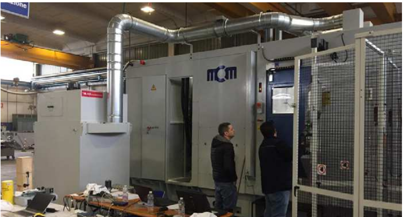
COALFILTER INSTALLATION ON MCM MACHINING CENTRE

AIR CLEANERS OF OIL MIST, FUME AND DUST FOR MACHINE TOOLS