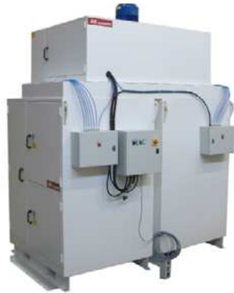
COALFILTER 8C56 SERIES