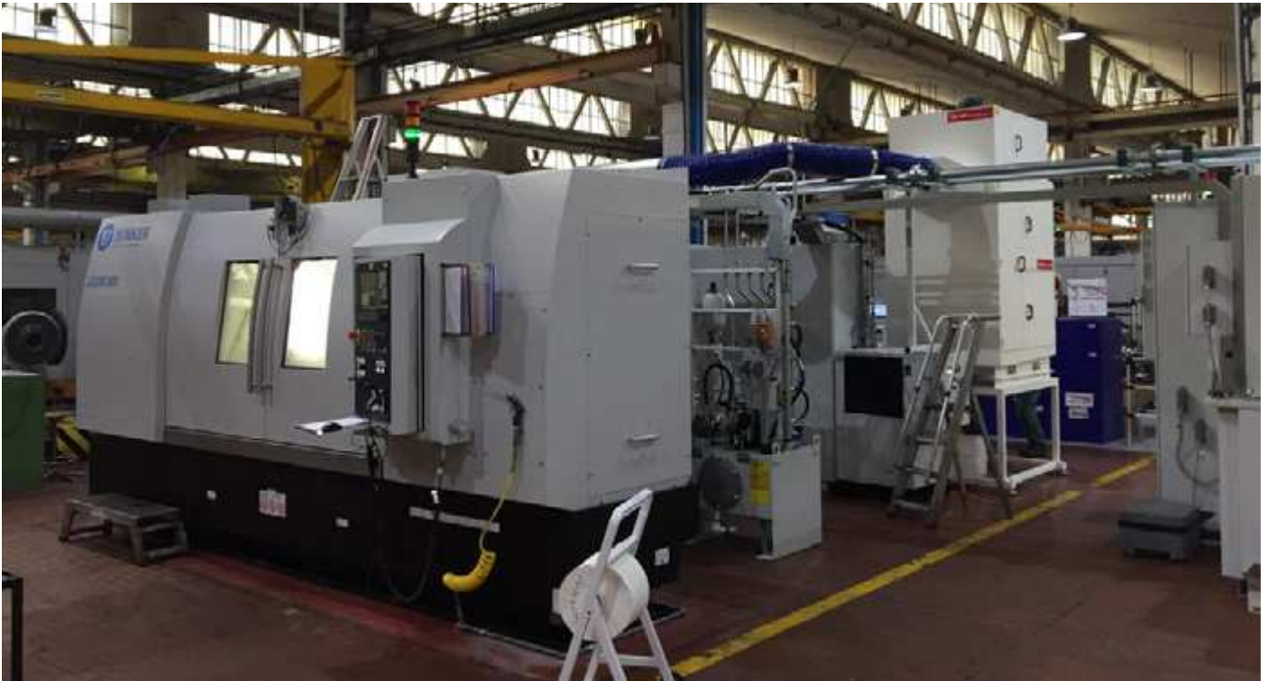
COALFILTER INSTALLATION ON JUNKER GRINDING MACHINE

At AR Filtrazioni we always offer turn-key solutions, installing the filters at the customer's premises thanks to our specialized personnel. Otherwise, we leave complete autonomy to the customer, since each system comes complete with an installation kit and an instruction manual, which make the installation of our filter units all over the world incredibly intuitive.